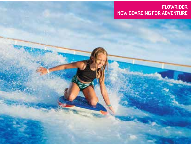
FLOWRIDER NOW BOARDING FOR ADVENTURE