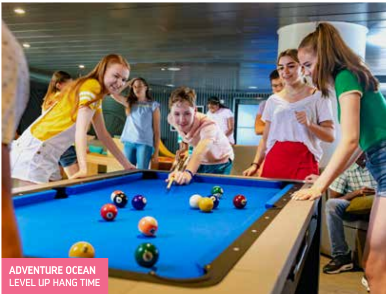
ADVENTURE OCEAN LEVEL UP HANG TIME