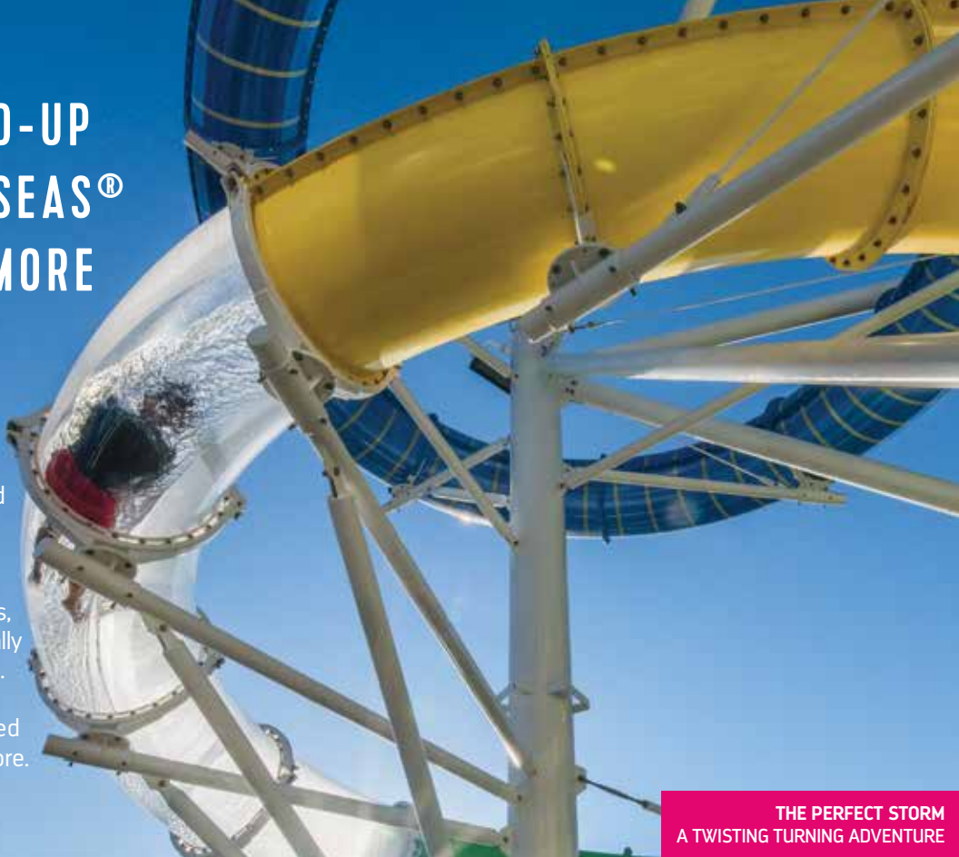
THE PERFECT STORM A TWISTING TURNING ADVENTURE

Ditch the road trip for an action-packed ship, with cruises sailing from Singapore. Only on Royal Caribbean.